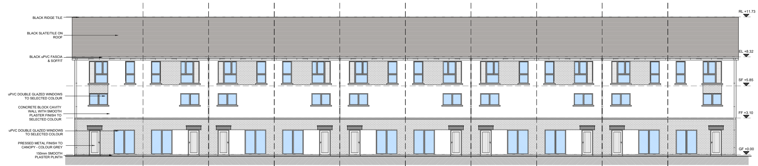
Rear Elevation SCALE 1:200 @ A3